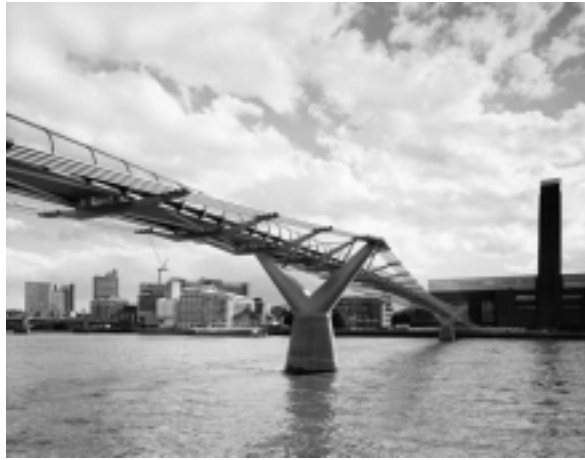
Figure 1: Millennium Bridge

an important clue. Normal walking pace is around two strides per second which produces vertical force of around 250 Newtons (55 pounds) at 2 hertz. However, there is also a small sideways force caused by the sway of our body mass due to the fact that our legs are slightly apart. 2 This force (around 25 Newtons or 5.5 pounds) is directed to the left when we are on our left foot, and to the right when we are on our right foot. This force occurs at half the frequency (or at 1 hertz). This was the frequency that was causing the problems. But should this matter? The sideways movement when we walk need not matter if one person's sway to the left is cancelled out by another person's sway to the right. It is only when many people walked in step that the sideways force would be a problem. It is well known that soldiers should break step before they cross a bridge. But for thousands of individuals each walking at random, could this be a problem?